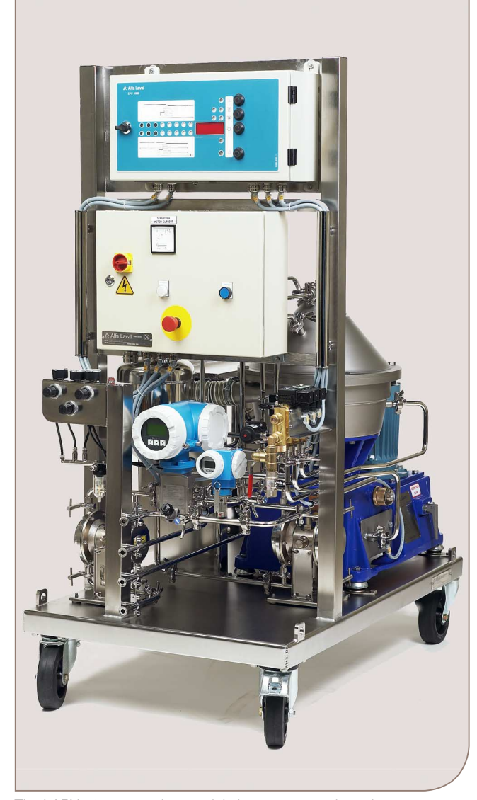
The LAPX 404 separation module is compact and requires less than 1 \,\mathrm{m}^2 of floor space.

The centrifugal separator can be used on a wide variety of biologicals because blinding of porous surfaces and subsequent flux reduction is avoided.